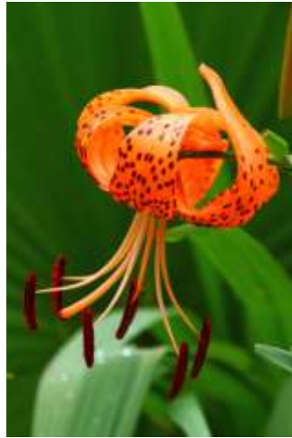
Linda Earley Leaves - Foliage - Flowers Grand Prize