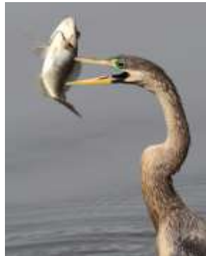
Anhinga with Fish Nature Projected