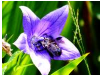
Bloom & Bug

Sleeping Bear Dunes National Seashore (OK, it's a lake, but any time you can't see the other side, it might as well be a sea.)