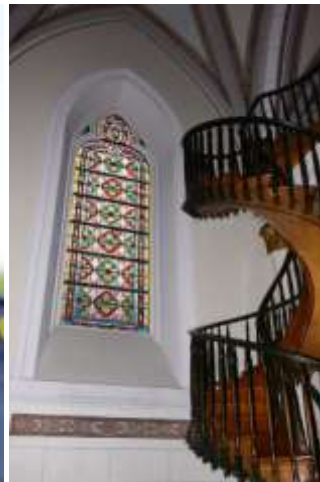
Ward Conaway Stained Glass