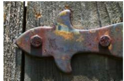
Linda Earley Hardware