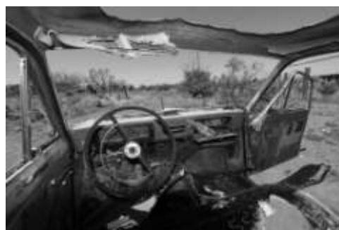
Ward Conaway Trucks pre-1970