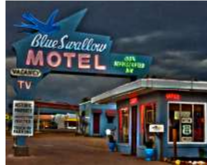
Jaci Finch APSA Blue Swallow Color Prints