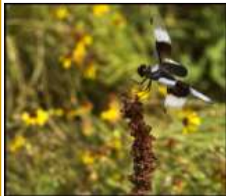
Dragonfly on Flower