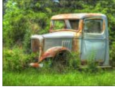
Old Blue Truck Abandoned to the Weeds Carol McCreary APSA, PPSA