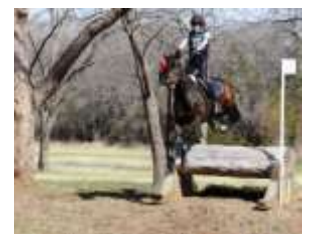
Catching Some Air Diane Hogue