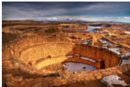
Kiva at Escalante Pueblo Robert Green