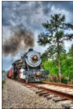
Engine 300 Train Carol McCreary APSA, PPSA