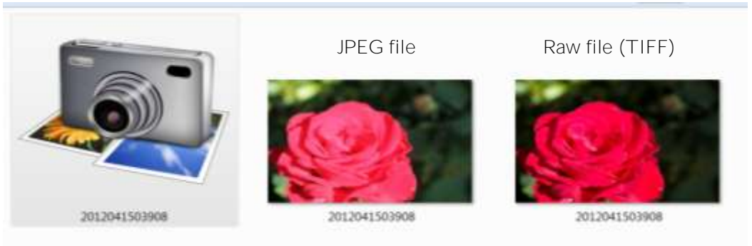
Fig 1 - all the same image saved in different formats as seen in browser

The raw file is large and will use more room on your card (Fig 2 shows files sizes). This means you can't take as many pictures on a small card and will likely purchase a larger card to accommodate your needs. When you open a raw file in your computer it uses a lot of memory, or RAM space, which may cause the computer with less than 4 GB of RAM to be slower.