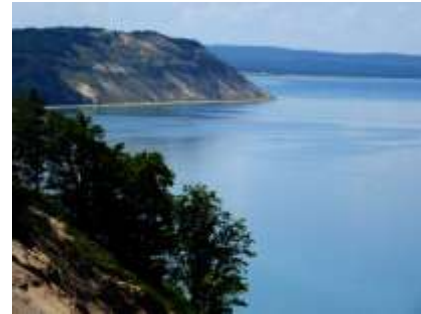
Sleeping Bear Dunes National Seashore (What?)

Some of the dunes are as much as 450 feet high. This one was about 200, steep and all sand. The nuts are the ones climbing it, or passing out trying.