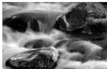
Winter Stream Derrell Dover