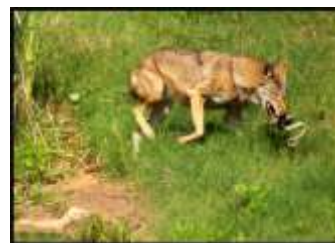
Red Wolf Catching Snake