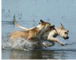
Flooded Sara Road Water Play George Williams