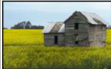
Old Farmhouse New Flowers Wally Lee APSA, PPSA