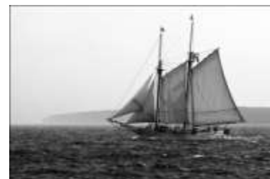
Ward Conaway The Heritage Monochrome Projected