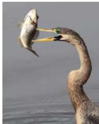
Anhinga with Fish