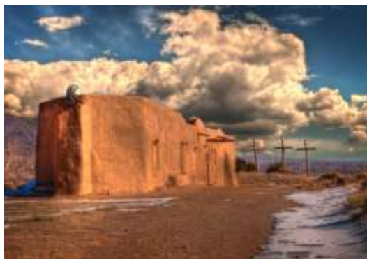
Penitente meroda, Abiquaiu, NM