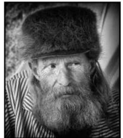
Mountain Man Stare