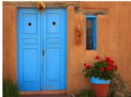
Blue Gate and Chillies Ward Conaway