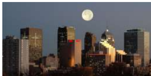
Moon over OKC