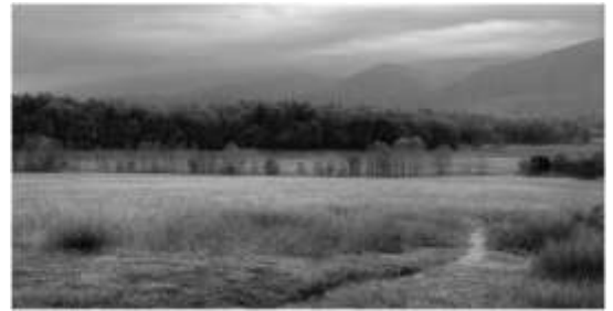
Cades Cove Ward Conaway