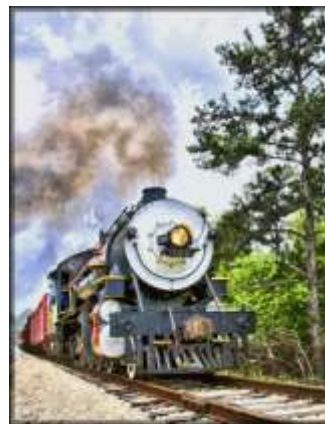
Engine 300 Painting Carol McCreary APSA, PPSA