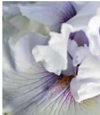
Budding Beauty Vickie Jenkins