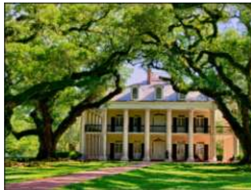
Oak Alley Plantation Tom McCreary EPSA