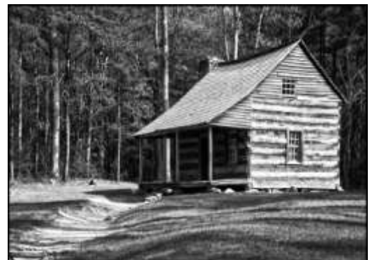
Carter Shields Cabin