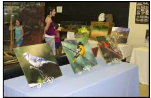
Prints Displayed Around the Room