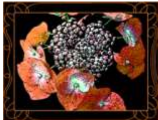
Busy Bee Inge Vautrin