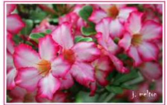
Best Flower of the Day Jack Melton