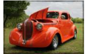
Orange Classic . Eva Ryan