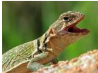
Common Collared Lizard