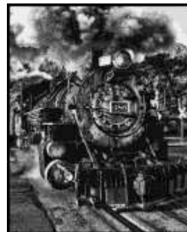
Pufferbelly Rolling Charles Taylor APSA