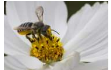
Orange Pizzazz Jack Melton