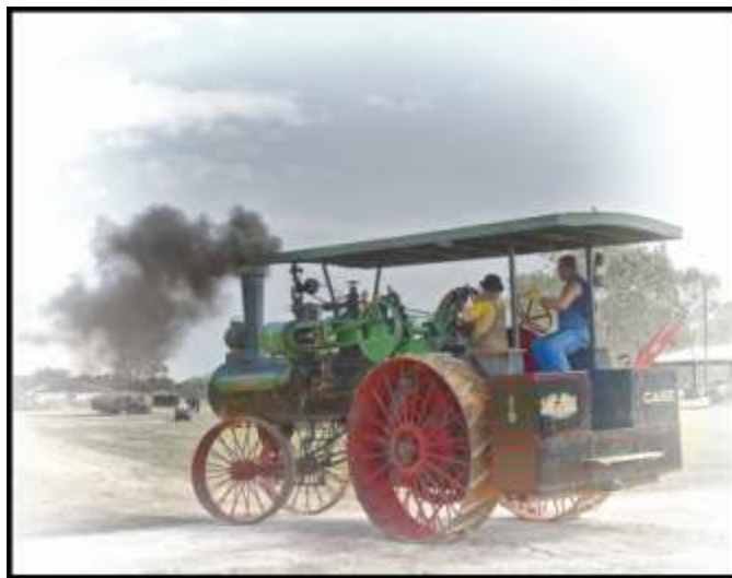
Steam Tractor - Topaz - Step 2 B&W Topaz Milk-Memory Edge with Local Adjustments

Whether you use Topaz BW Effects for color or monochrome images, it is a useful, reasonable priced plug-in for Photoshop or Photoshop Elements.