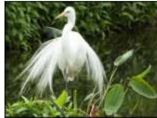
Egret #3 Wally Lee APSA, PPSA