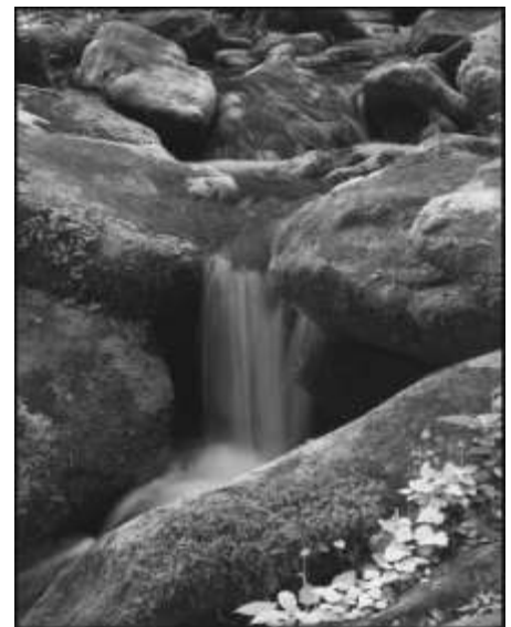
Topaz Image on Right

Topaz has one other preset which I have used several times, the Opalotype - milk memories. This preset creates a muted color image with white vignette. You can also bring back some of the color in the image to create more saturated colors.