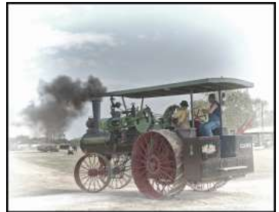
Steam Tractor - Topaz - Step 1 B&W Topaz Milk-Memory Edge