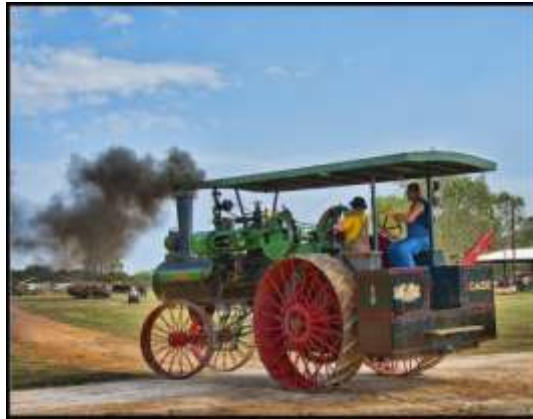
Steam Tractor - Original Color Image