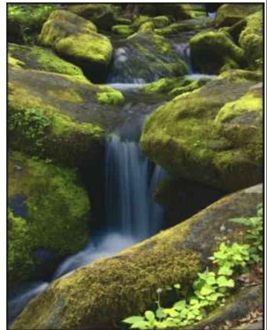
Smoky Mountain Moss and Water Fall Carol McCreary APSA, PPSA

The NIK silver efex pro 2 plug-in currently costs $199. There are at least 47 visual presets; global controls of brightness, contrast, saturation, structure, film types, and toning to further enhance your image. Local U Point technology can be used for incredibly precise selections and adjustments. Finally, vignettes, burned edges, or natural image borders may be used to finish your black and white masterpiece. Selective color toning can be applied along with a selective color tool that enables you to quickly and easily add color elements back into your photograph