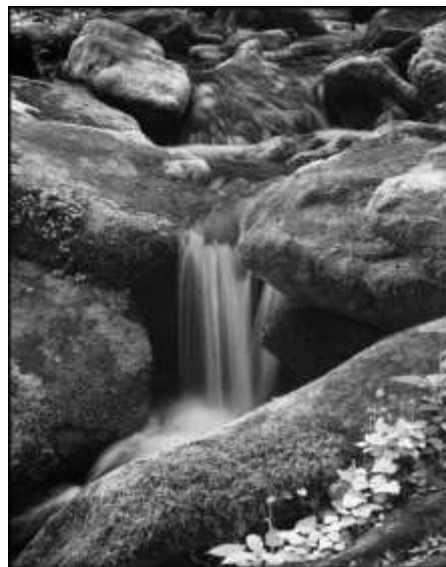
Nike Image on Left

As you can see, the end results are very close. The structure or detail adjustment in NIK provides slightly different results. The NIK software preset used was the 005 - high structure and contrast with some local adjustments of dodging and burning. The Topaz preset was the traditional - neutral grayscale with some local adjustments of dodging and burning. (See comparison below.)