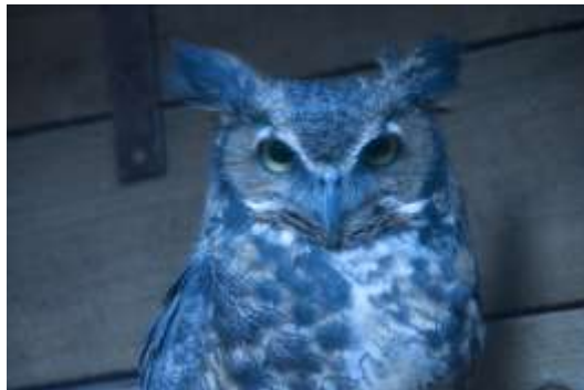
What the Camera Records