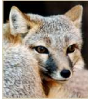
Swift Fox Debbie Devon-