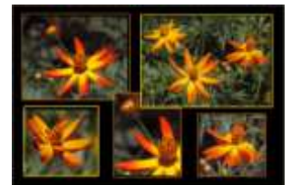
Floral Scape Debbie Devonshire