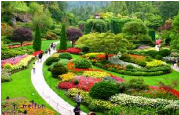
Best Photo of the Day Jack Melton