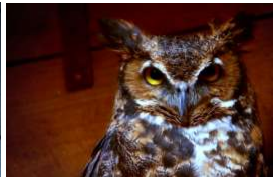
What the Photographer can See and Visualize

For in truth great love is born of great knowledge of the thing loved.