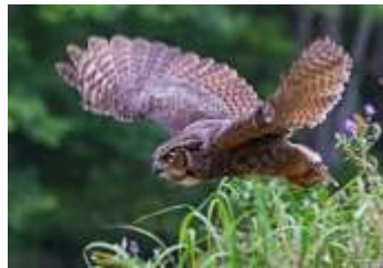
Owl in Flight