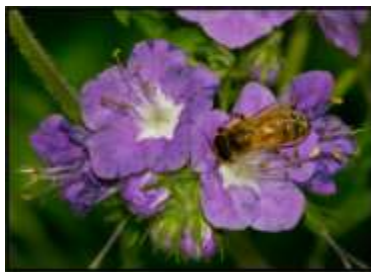
Bee on Purple Phacelia