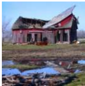
El Reno Barn