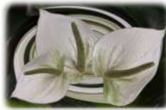
Flower Swirl Debbie Devonshire