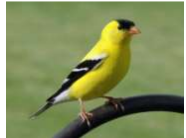
In Breeding Plumage Jennifer D'Agostino