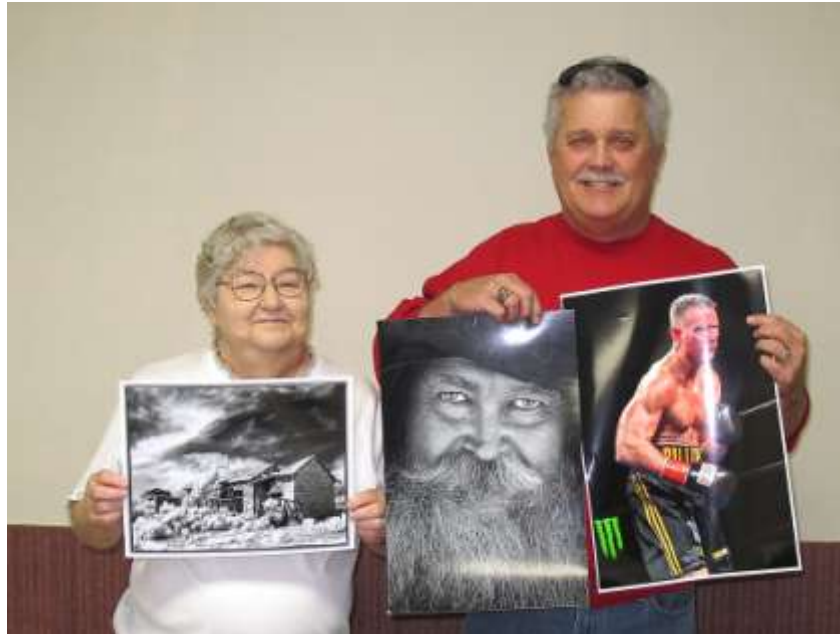
Nevada House in Ruins