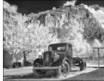
Capital Reef Old Truck Carol McCreary, APSA, EPSA