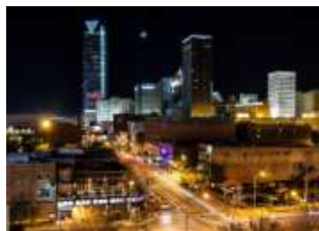
Oklahoma City at Night