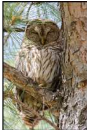
Barred Owl Napping