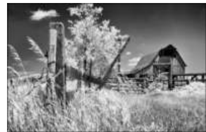
Missouri Farm in Ruins