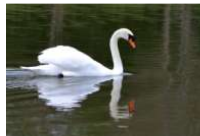
Reflection Jim McIntosh