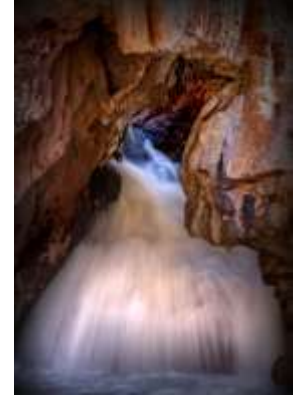
Soda Dam on Jamez Creek