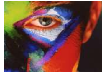
My Human Canvas Divana West P/A Print Victory Christian School 2nd HM

PSA conducted the final youth judging competition receiving 369 print entries and 462 digital entries. They selected 220 acceptances (103 prints & 117 digital images) plus 18 top winners. The youth showcase will be presented at the PSA Convention in Portland, Maine.