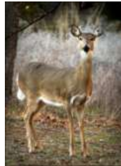
Deer Stare Down Inge Vautrin