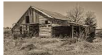
The Old Barn Bob Protus