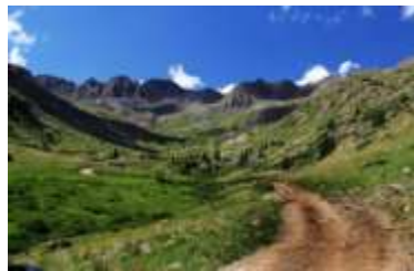
Great American Basin Caitlyn Minton Landscape Digital Kingfisher HS 2nd HM