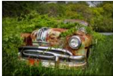
Old Pontiac Inge Vautrin