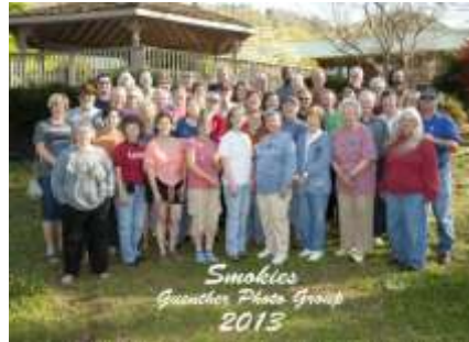
Many Photographers representing a number of states attend