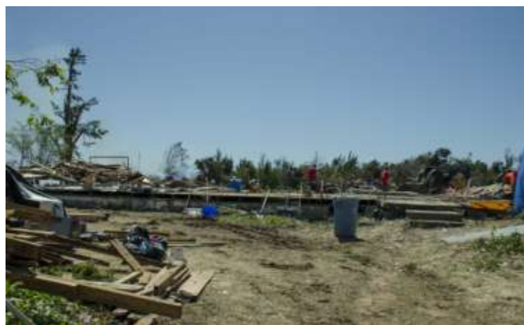
Only the Slab Remains