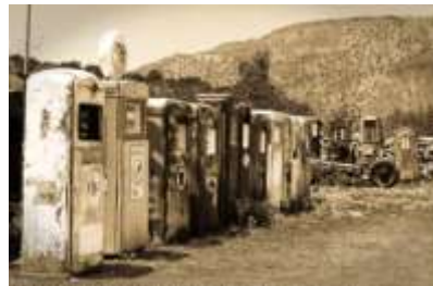
Gas Pump Graveyard Linda Earley