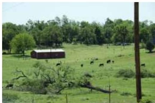
Beautiful Country Setting