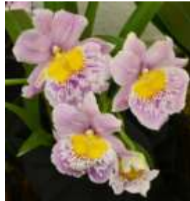
Display in Purple Jim McIntosh