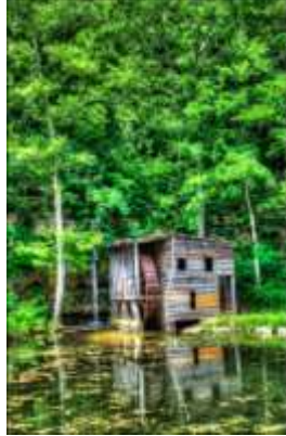
Old Mill and Reflection