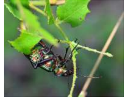
Green Dock Beetle Diane Hogue