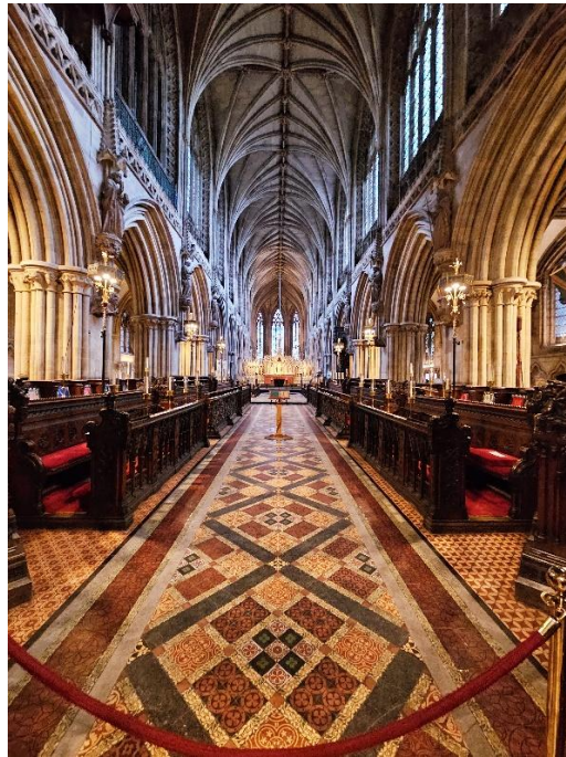
“Lichfield Cathedral”