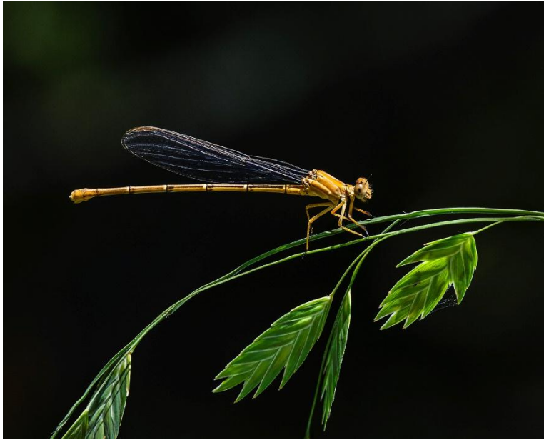
"Perched in The Wind" Piers Blackett