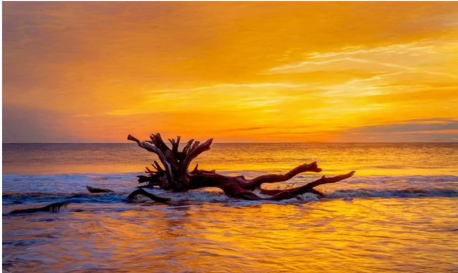
“Good Morning” Lyuda Cameron