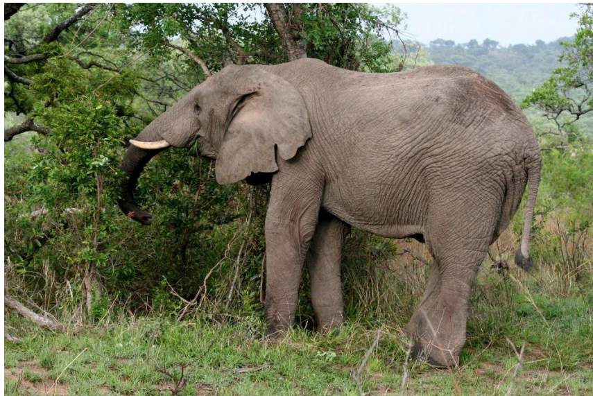
"I'm Watching You" Jaci Finch