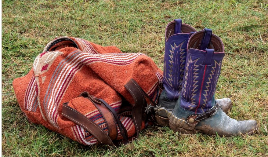
“Orange Bag and Purple Boots” Wally Lee